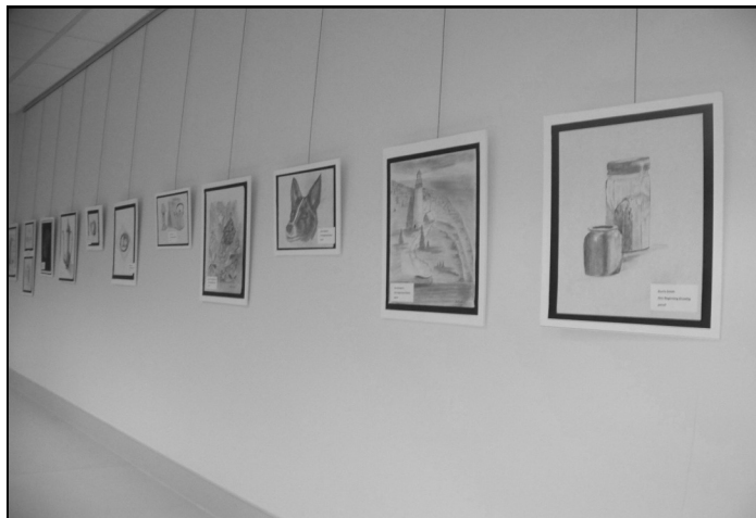
The drawings in the current display are from OLLI winter class participants in "Draw Out Your Creative Side".

Contact Penny Nickle by April 16 if you are interested in participating at 989-790-7442 or at pennyn62@gmail.com If the item is larger than 24 x 30 or heavier than 10 pounds you will need to discuss your needs with Penny